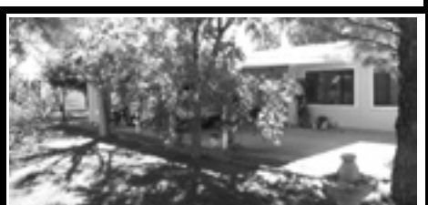
#3810 ~ 1041 Turtleview ~ $114,500. 4 BR / 1-3/4 BA