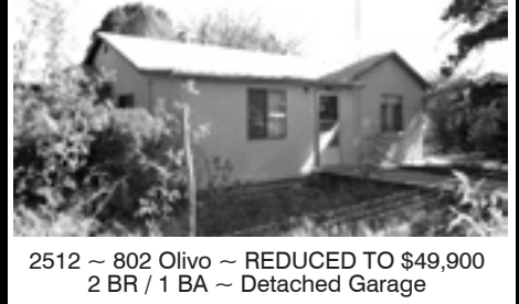
2512 ~ 802 Olivo ~ REDUCED TO $49,900 2 BR / 1 BA ~ Detached Garage