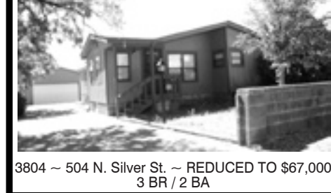
3804 ~ 504 N. Silver St. ~ REDUCED TO $67,000 3 BR / 2 BA