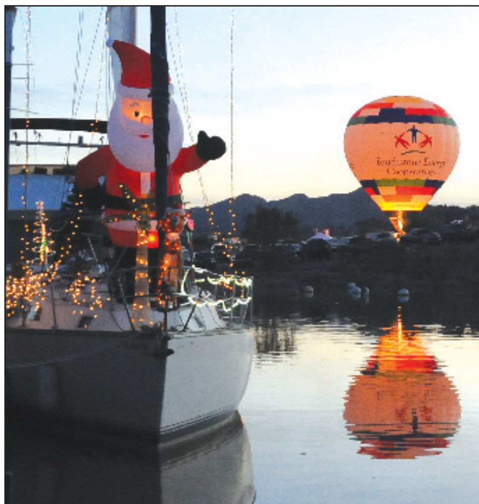
BOATS AND LUMINARIAS – Elephant Butte Lake State Park saw a huge influx of visitors Saturday when the Annual Floating Light Parade and the Luminaria Beach walk were held. See additional photos on Page A6.