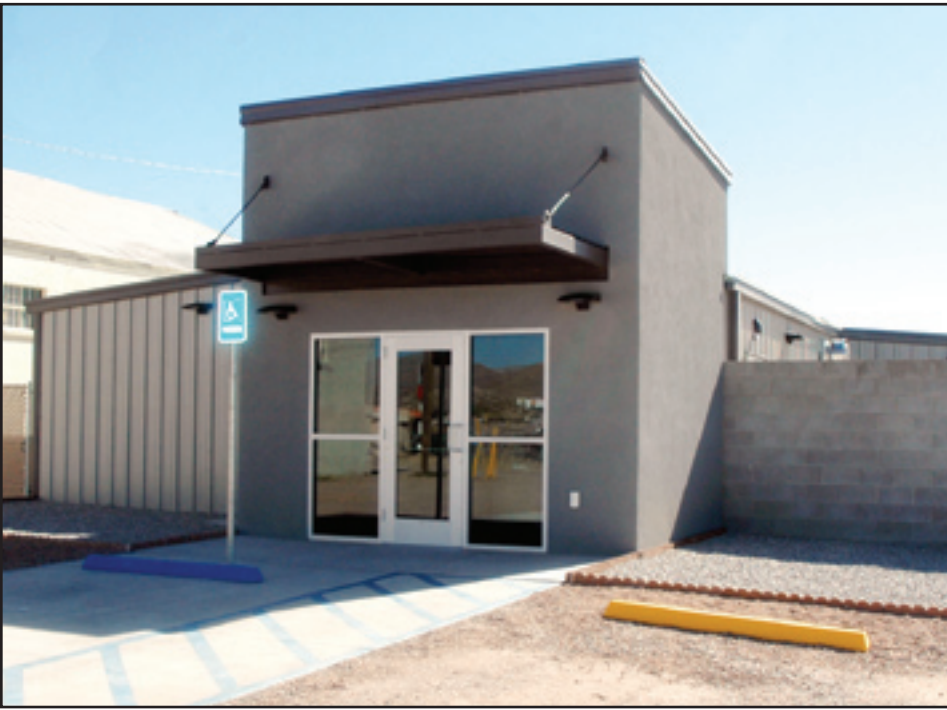
TorC Animal Shelter, 1101 N. Cedar St., Suite C